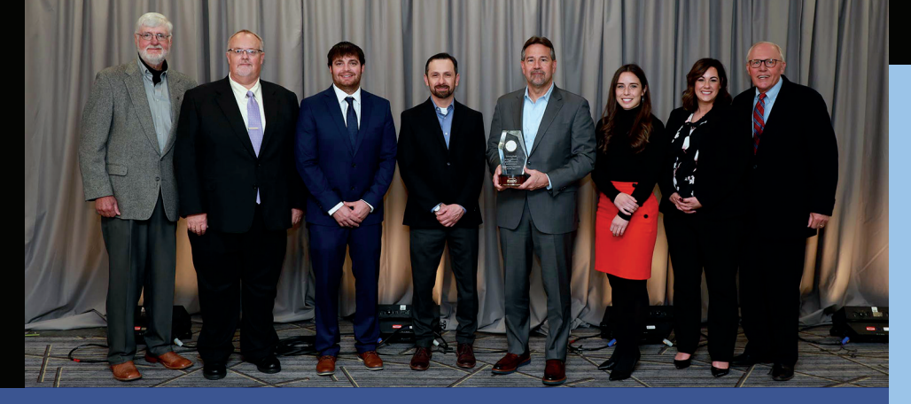
Above | TrinityRail receives the 2021 Venture Award for Iowa Area Development Group's Outstanding Business of the Year award. Trinity Industries selected Butler Logistics Park near Shell Rock as the location of TrinityRail, a $60 million state-of-the-art rail maintenance facility to serve the upper Midwest. This facility is the largest and most equipped maintenance facility in the Trinity Industries network serving Class 1 railroads and shippers.